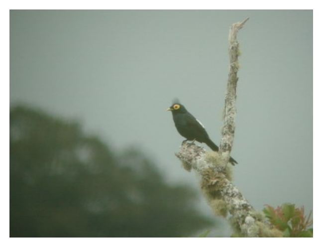
Eastern Hill Mynah Gracula religiosa palawanensis Good views of 3 birds near Sabang (April 30, Palawan). Two more birds at Palawan (May 2).

At least 10 of these enigmatic birds seen at Mt. Kitanglad (April 24, Mindanao). Surprisingly, the Myna's seemed only to be active (and therefore also easily seen) during overcast weather.