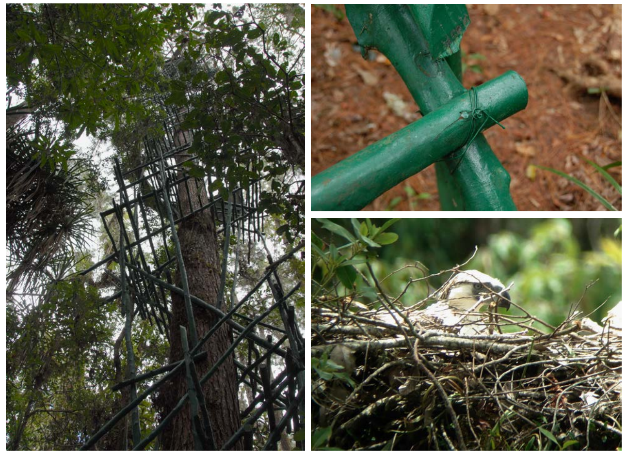
Incredible views of an adult male perched at "eye level" and an almost full grown immature bird at nest. Left (12.15) for 'Mindiz' in Malaybalay (lunch). Brief drive to Damitan. Walk to the Kitanglad Lodge (Mt. Kitanglad), accompanied by two horses carrying our luggage. Evening walk for night birding rewarded by fire-flies and stunning

April 23. Early domestic flight (05.00 departure) to Cagayan de Oro ( Mindanao ). Drive from 07.30 till 10.30 to Conchona to visit the nest of the Philippine Eagle after a 30 min walk. Shaky climb to the hide (30 m). The rather ramshackle construction was financed by National Geographic Society.